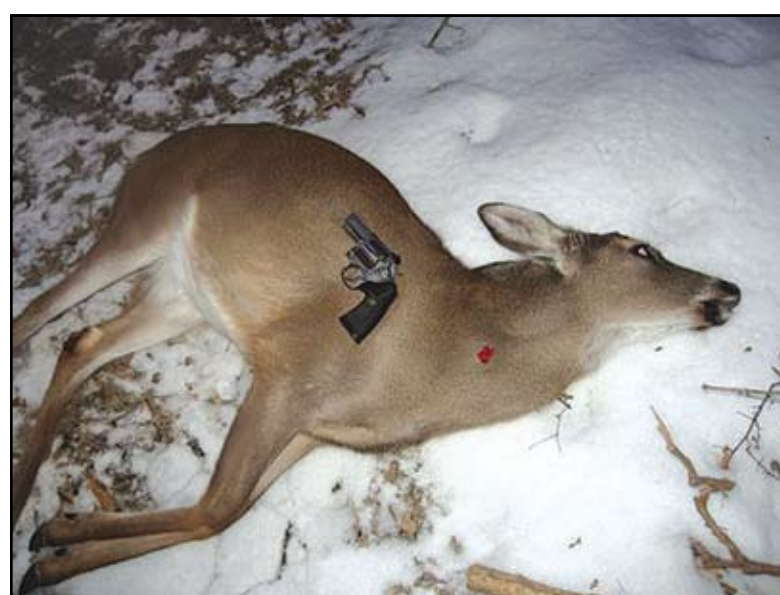
Craig H's .357 finds its mark—the whitetail world stands in fear.

So if your agency or unit is looking for a no-nonsense, rugged upgrade to your existing breaching tools, you'll find none better than the Gränsfors Smide line from Blackheart International.