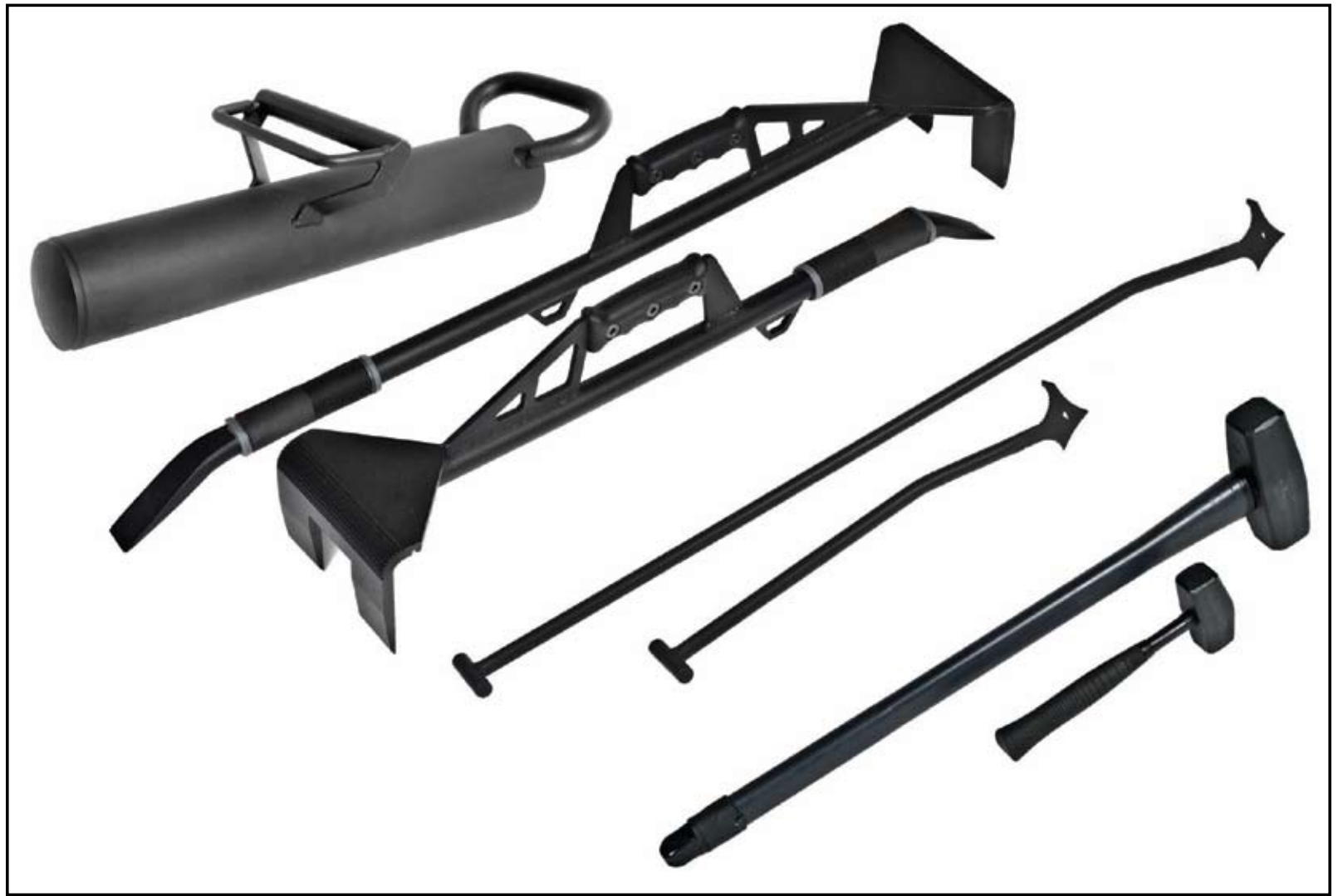
Blackheart International is the exclusive U.S. distributor of the Swedish-made Gränsfors Smide line of breaching tools—the strongest, most durable conventional-style breaching tools on the market today.

It's a given that breaching tools take a beating...literally. That's what they're designed for. Unfortunately, not all breaching tools on the market today stand up to the realities of the field. For some, their material construction leaves much to be desired. Others may be adequately robust for the task assigned, but are unnecessarily heavy or awkward for the breacher to employ. Still others score high in the construction and ergonomics departments, but due to their unique mechanical nature aren't the most practical tools to